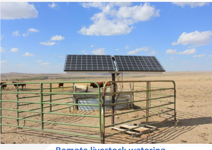
Remote livestock watering