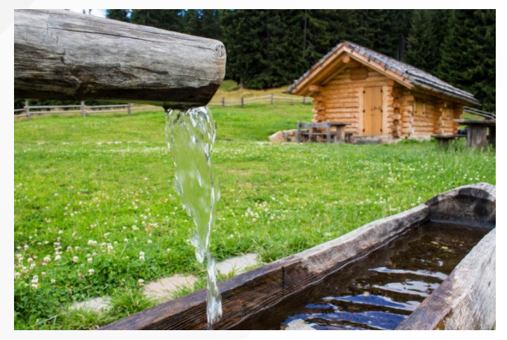
Remote livestock watering