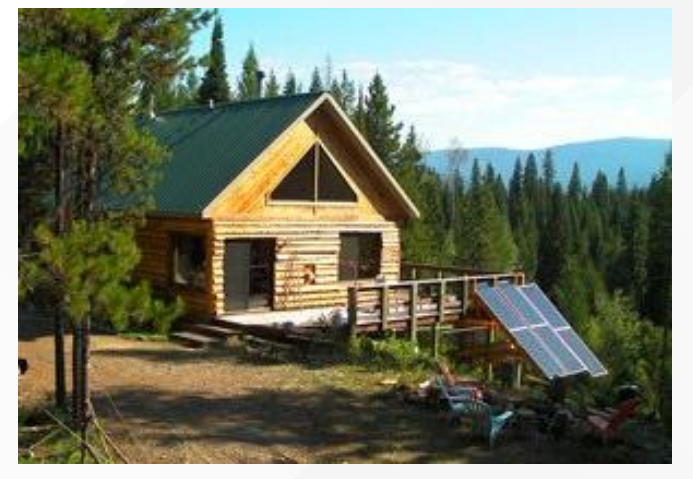
Off grid cabin well pumping